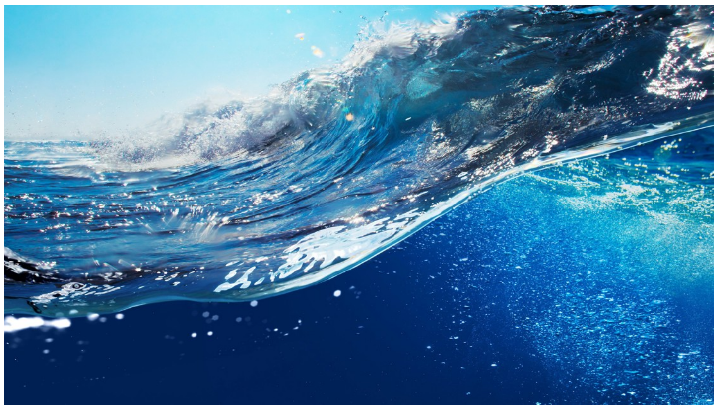
Disembarkation & Flight back to Reykjavik