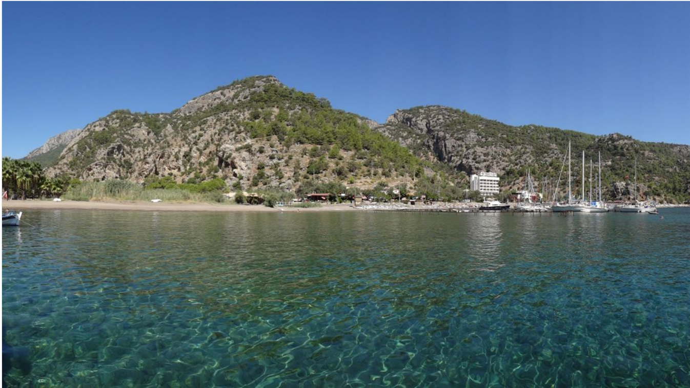
Turkey / Ciftlik Bay