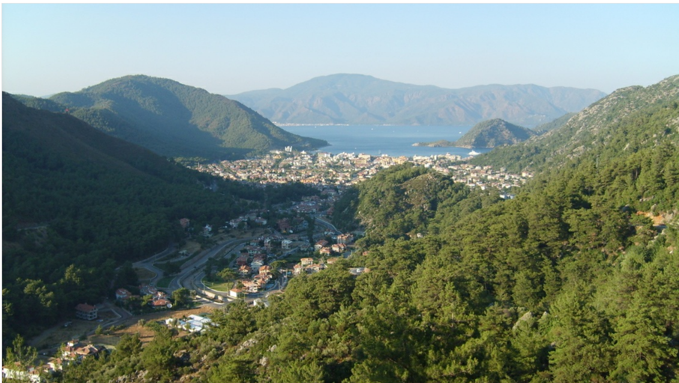
Turkey / Marmaris