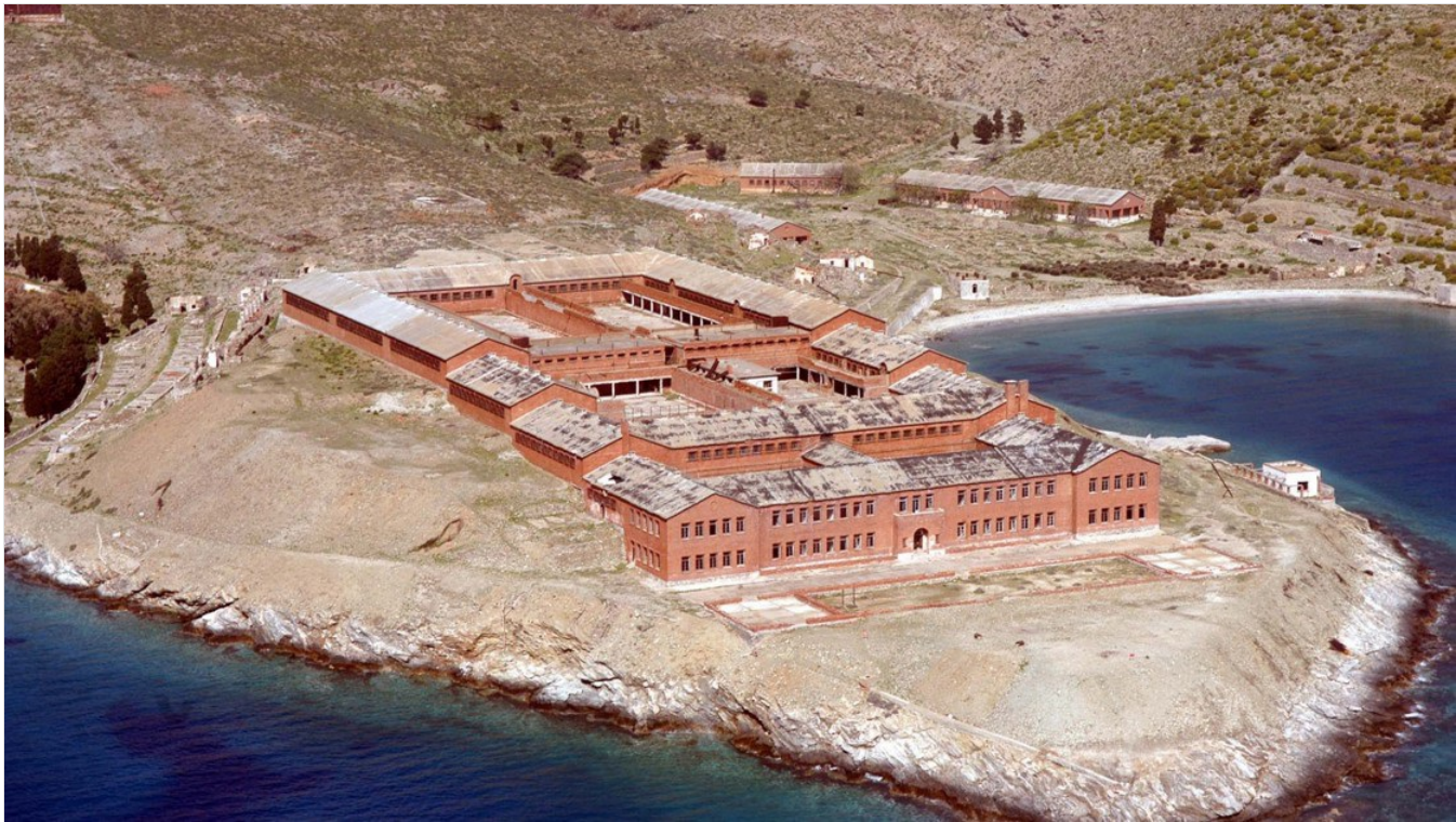
Greece / Yiaros