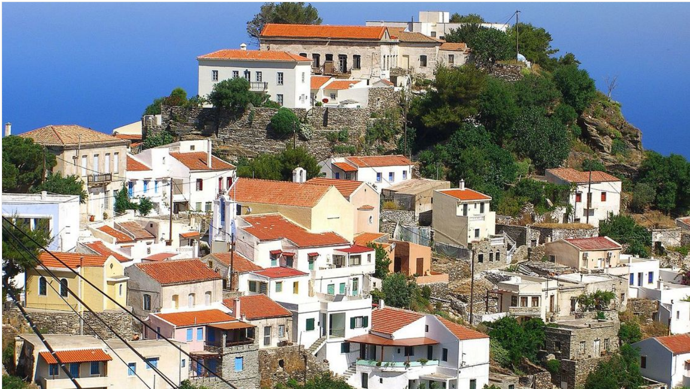
Greece / Kea