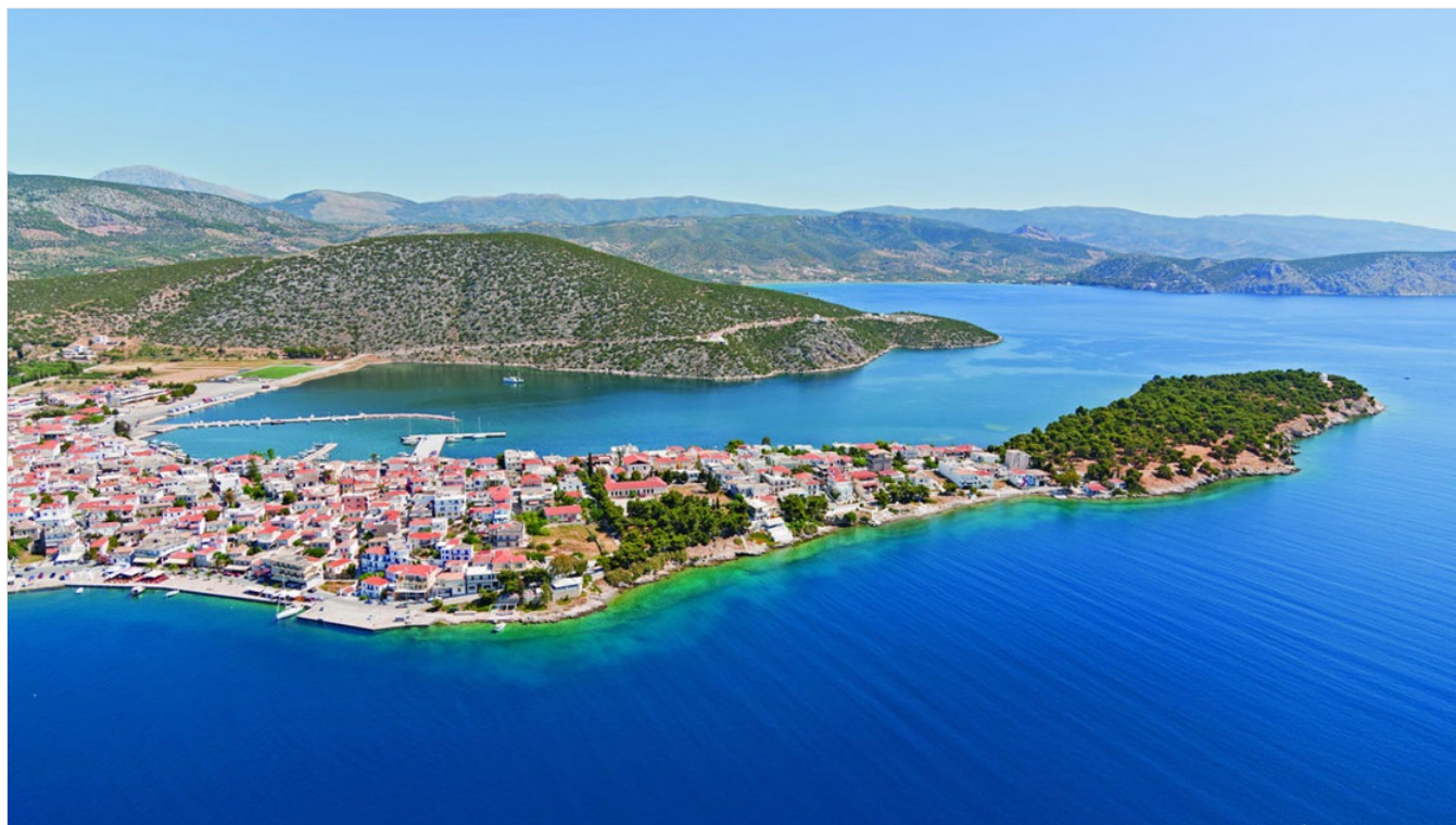
Greece / Ermioni